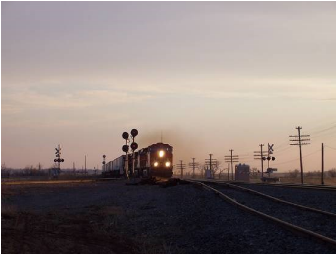
Above: At 70 miles per hour, this Kansas City bound Piggybacker will disappear across the Oklahoma prairie as quickly as the sky darkens in the vivid sunset. You probably have never heard of Avard, but to a railfan, this is a "hot spot." This line in northwestern Oklahoma was the Santa Fe mainline. Now as the Burlington Northern Santa Fe's "Transcon," these rails see more action than ever, over a hundred trains a day.